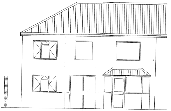
EXISTING REAR ELEVATION (1:50)