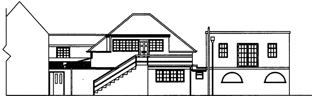
EXISTING SIDE ELEVATION - WEST