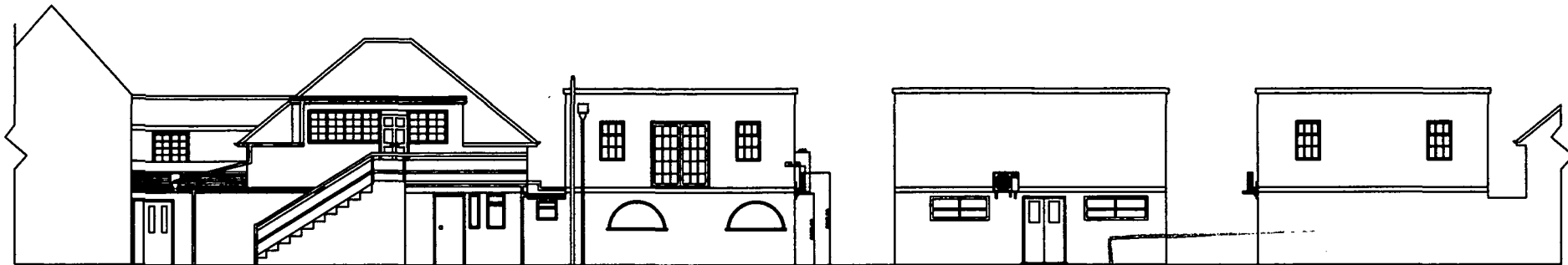
PROPOSED SIDE ELEVATIONS & REAR ELEVATION