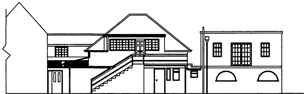
PROPOSED SIDE ELEVATION - WEST