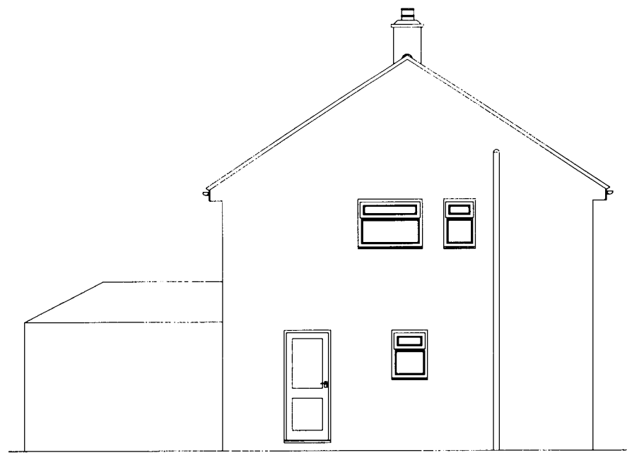
EXISTING SIDE ELEVATION (1:100)