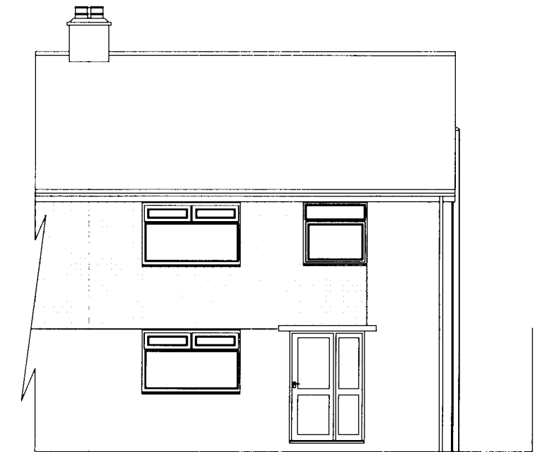
EXISTING FRONT ELEVATION (1:100)